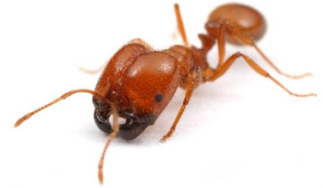
S. geminata worker (major)