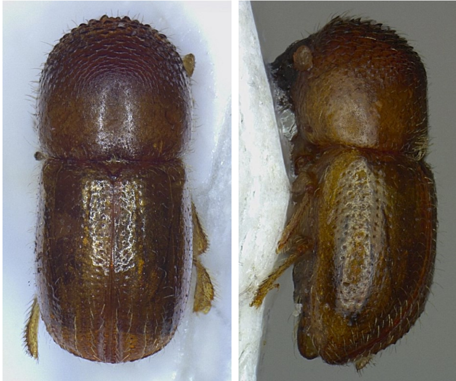
Figure 1. Anisandrus maiche adult trapped at Serravalle-Leggiuna 1 (Ticino), dorsal and lateral. Specimen length approximately 2.0 mm. (L1_13.5.22_AM_sm_1 / L1_13.5.22_AM_sm_1_lateral).