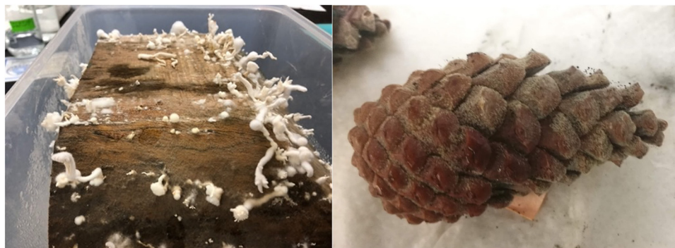
FIG 2 Samples following incubation in moisture chambers at 22°C. (Left) Wooden bowl from Philippines with immature fruiting bodies of Schizophyllum commune . (Right) Pinecone from Italy with multiple fungal fruiting bodies present.

The following research was conducted to assess the potential risk of intercontinental importation of exotic fungal pathogens on wooden handicrafts purchased from six retail stores in Gainesville, FL. Two studies were conducted, with study 1 being carried out as a pilot study and included undergraduate students enrolled in a lab-based course and study 2 was a larger repetition of study 1.