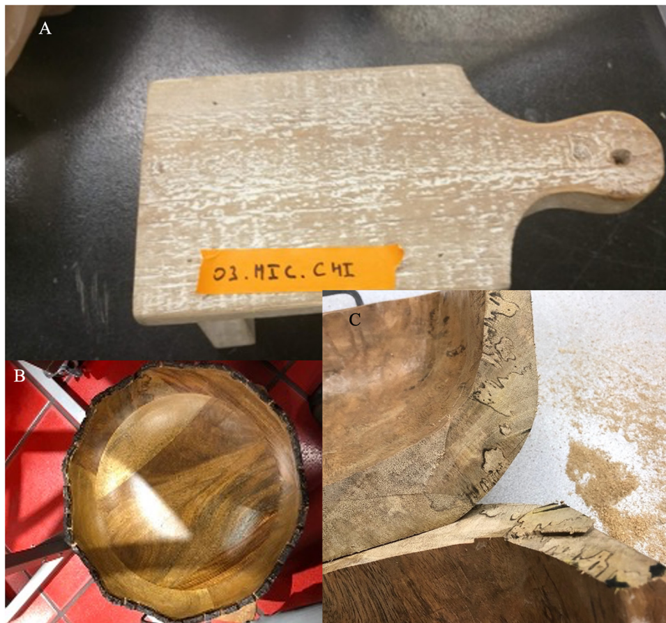
FIG 1 Three examples of wooden handicrafts tested in this study. (A) Wooden cutting board used in food preparation from China, with extensive white-pocket rot decay evident. (B) Bowl from Philippines used with bark present. (C) Bowl from Indonesia displaying decay and zone lines indicative of advanced fungal decay and colonization.

detected during inspection, then quarantine actions will be taken. Thus, these materials are not subject to the requirements outlined above.