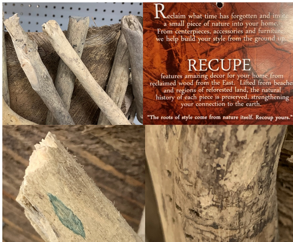
FIG 3 Decorative, mixed-materials bowl made of driftwood and coconut fiber sold in a retail store in Gainesville, FL (Origin: Philippines). Note the label in the upper right corner marketing “inviting nature into your home” using “reclaimed wood from the East.” Note also the green stain associated with recent fungal growth on wood in lower left panel and the zone lines and discoloration associated with recent decay fungi activity in lower right panel.